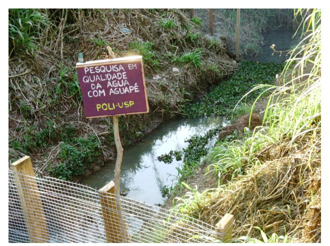
Figure 1 - Experiment 1 delimited by the grids upstream and downstream.

The first experiment was developed on Itaim Creek (Creek #01) between September and December, 2012. Around 500 young plants were allocated on a portion of Itaim Creek of approximately 1m x 10m, in a section characterized by steep slopes, high solar radiance and big flow variation in rainy periods. The extent of the first experiment can be seen on Figure 1. The second experiment took place on a small tributary from Itaim Creek (Creek #02), from April to July, 2013, using about 50 adult specimens of water hyacinth placed in a tributary channel of Itaim Creek. It had approximately the same size of the first experiment, and it was characterized by slow flows, lower solar radiance and domestic sewage inflow from surrounding areas.